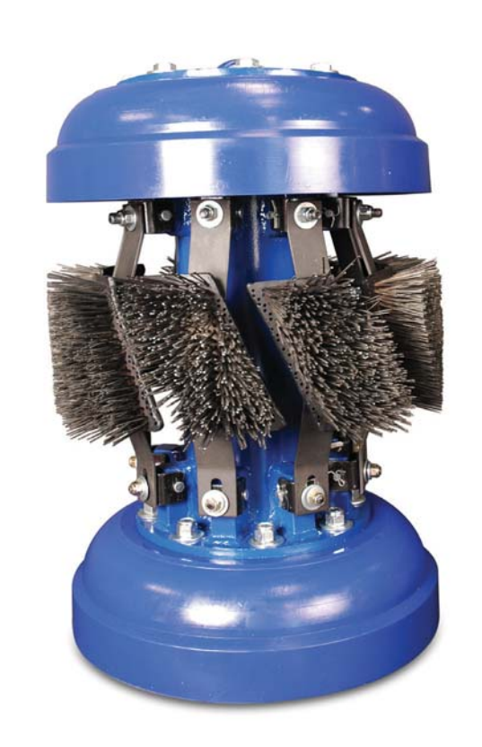
HZ DC Cup Pig